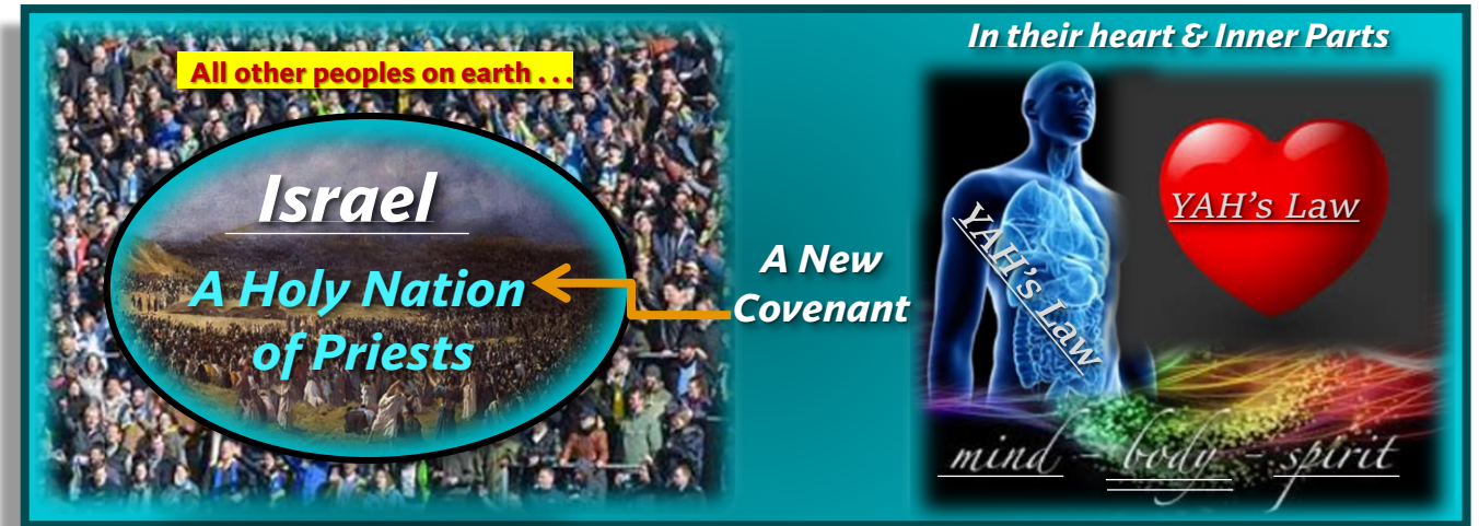
A nation chosen out of all nations

#4 – YAH will fulfill his prophesy of the New Covenant with Israel spoken of in Jer. 31:31-34 – "Behold, the days come, saith the LORD, that I will make a new covenant with the house of Israel, and with the house of Judah: 32 Not according to the covenant that I made with their fathers in the day that I took them by the hand to bring them out of the land of Egypt; which my covenant they brake , although I was an husband unto them, saith the LORD: 33 But this shall be