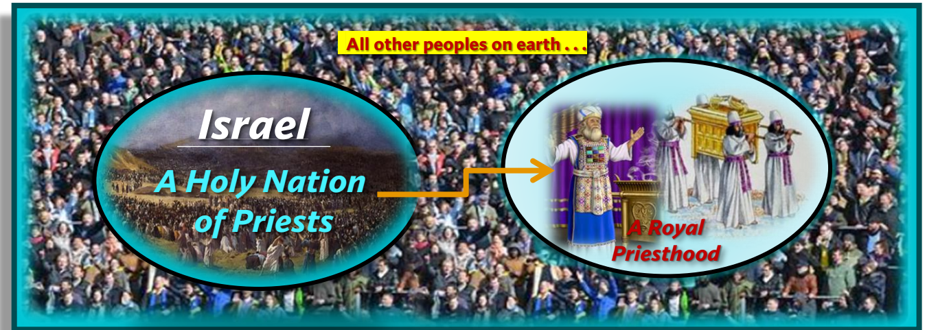
A nation called a “Royal Priesthood”

So how will these fifteen hundred years be useful to Israel in the future? We will answer that question a little later. So, what was another purpose in YAH's eternal plans for Israel?